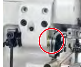
<Presser arm shaft at its upper position>

<Presser arm shaft at its lower position> Suitable for sewing woven fabrics, etc., preventing puckering.