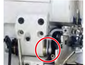
<Presser arm shaft at its lower position>